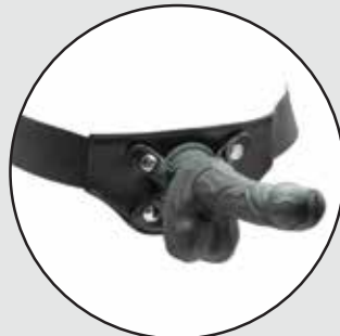
COMPATIBLE WITH MOST HARNESSES