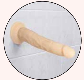
STRONG SUCTION BASE

100% PLATINUM CURED INCREDIFEEL SILICONE DUAL-DENSITY REALISTIC TEXTURE