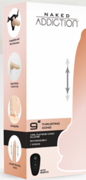
88225 9" Vanilla Thrusting Dong with Remote