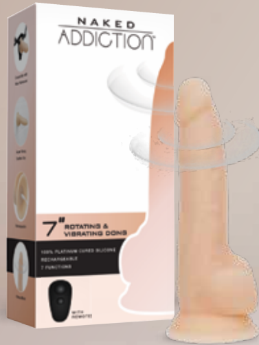
88325 - 7" Vanilla Rotating & Vibrating Dong with Remote

Overall Length: 7in (178mm) Insertable Length: 4.7in (120mm) Diameter: 1.75in (45mm)