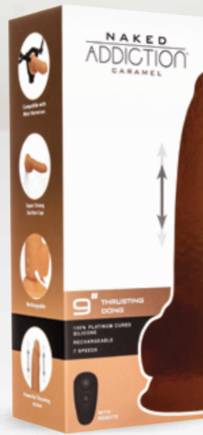
88425 9" Caramel Thrusting Dong with Remote

Overall Length: 9in (228.6mm) Insertable Length: 6in (152.4mm) Diameter: 1.75in (45mm)