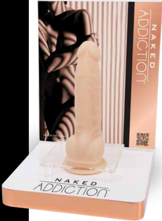
Counter Display Available Item # 5-803 Includes #88125 Tester (Rotating & Vibrating Dong)