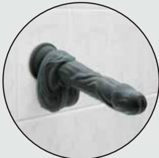
STRONG SUCTION BASE