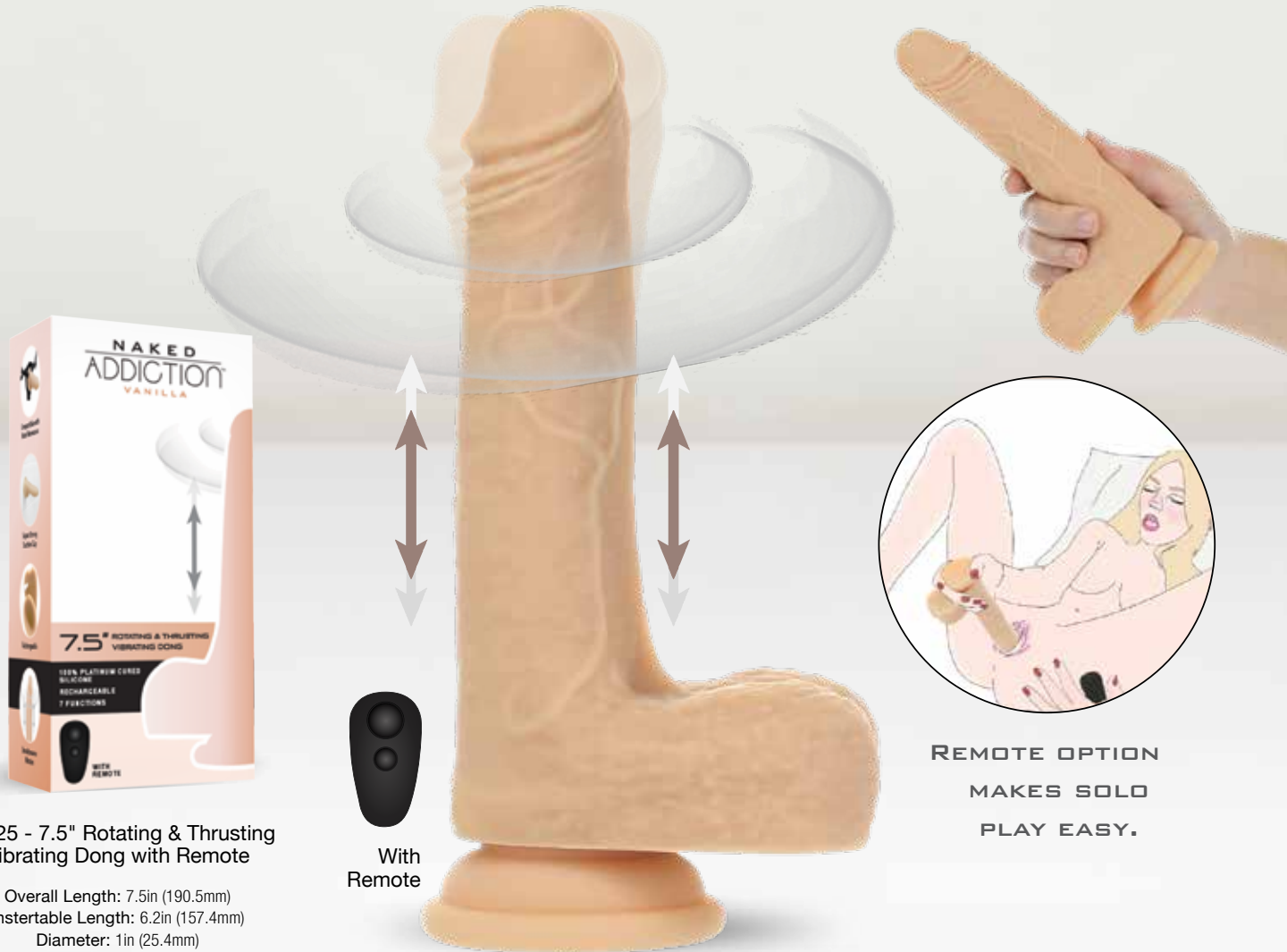
88525 - 7.5" Rotating & Thrusting Vibrating Dong with Remote

Overall Length: 7.5in (190.5mm) Insertable Length: 6.2in (157.4mm) Diameter: 1in (25.4mm)